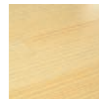
Vertical Grain Natural