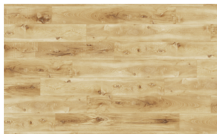
CHELSEA CREEK CFLCW1784XL