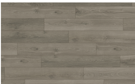
STONY POINT CFLCW2960