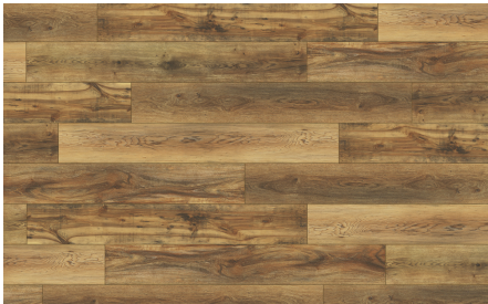
KETTLE CREEK CFLCW058XL